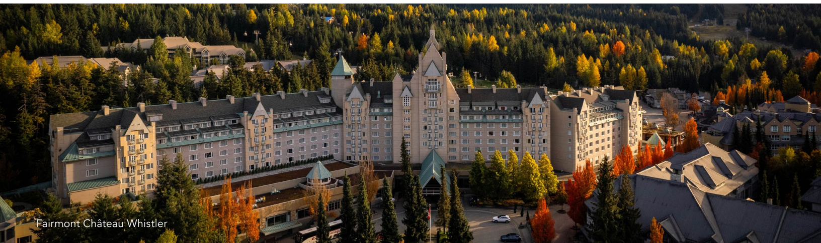
Fairmont Chateau Whistler

Consumer Protection BC Licences: Kamloops 178, Vernon 655, Kelowna 588, Penticton 924, Victoria 65842