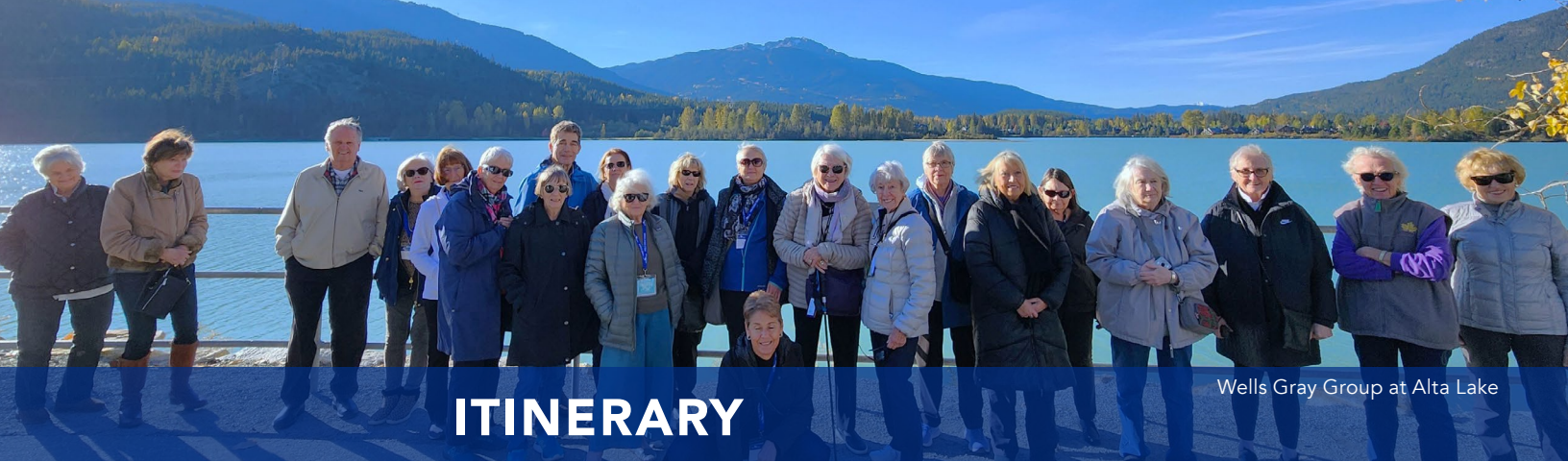
Wells Gray Group at Alta Lake