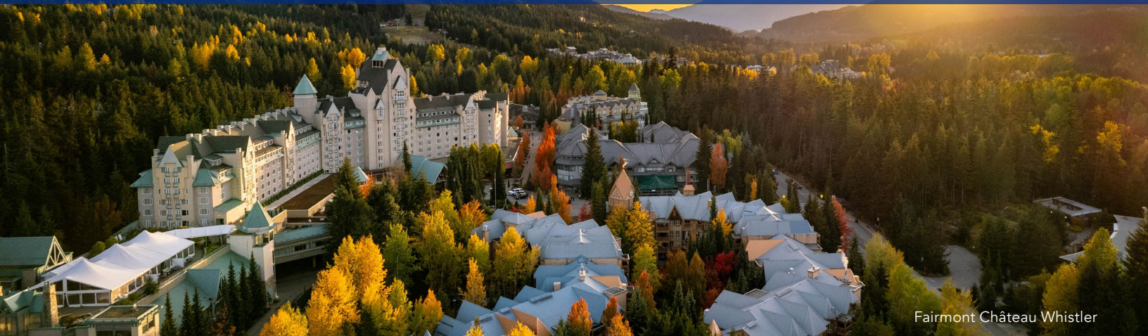
Fairmont Château Whistler