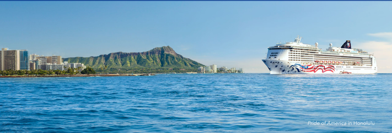
Pride of America in Honolulu