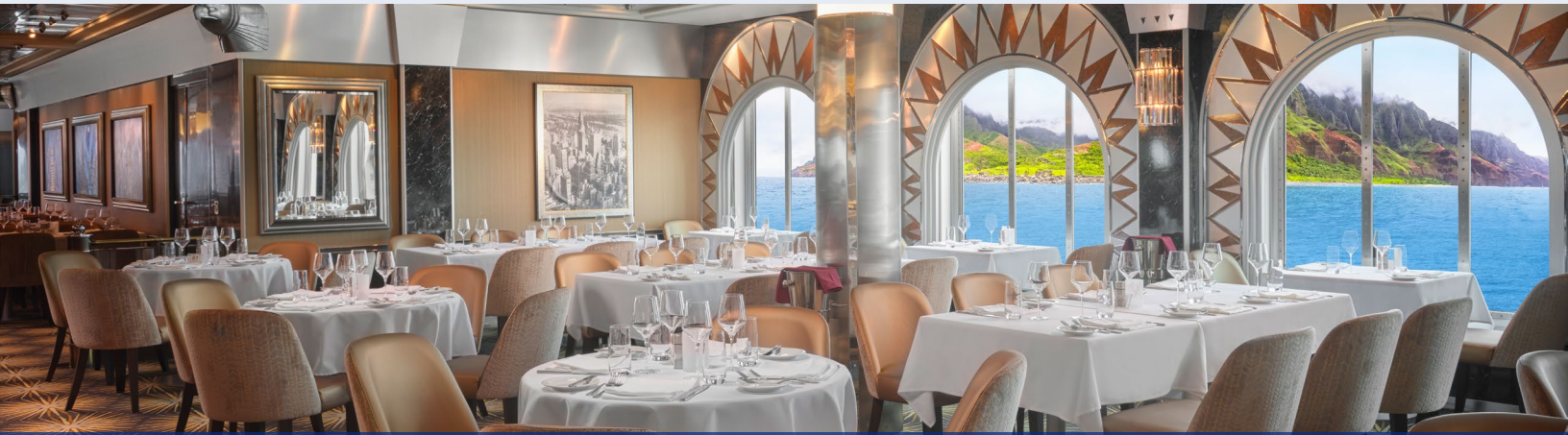
Pride of America Dining