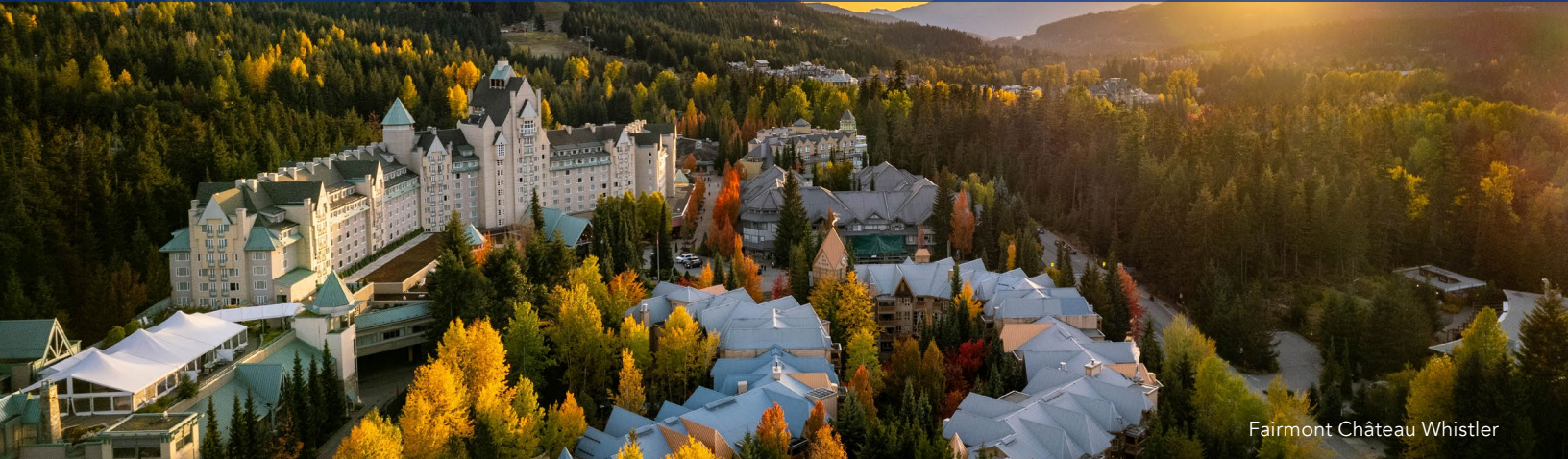
Fairmont Château Whistler