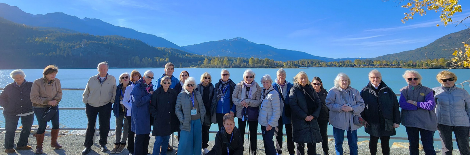
Wells Gray Group at Alta Lake