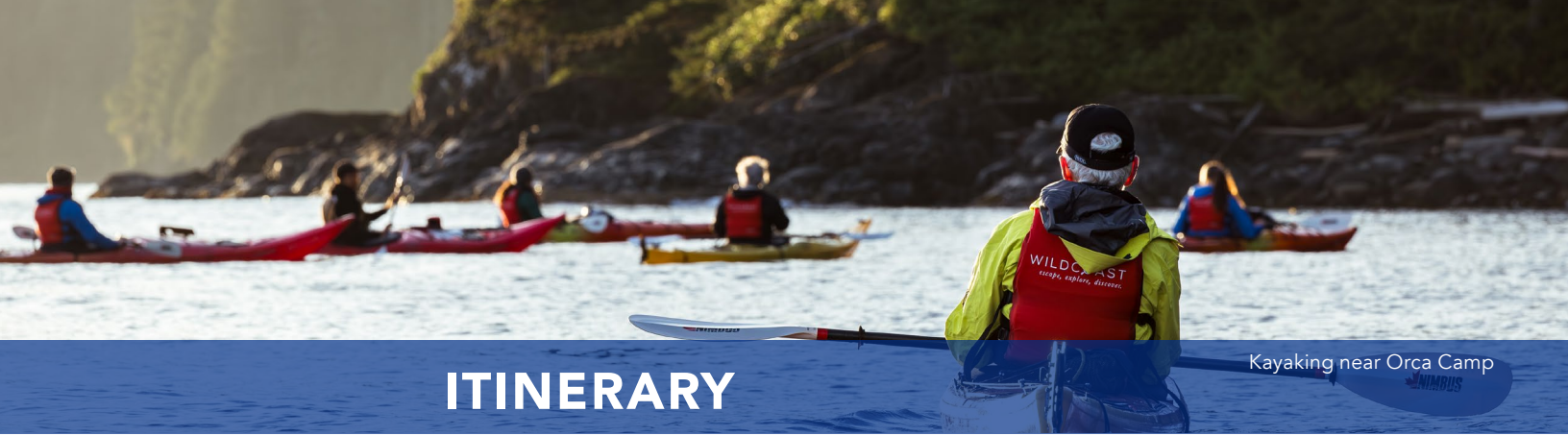
Kayaking near Orca Camp