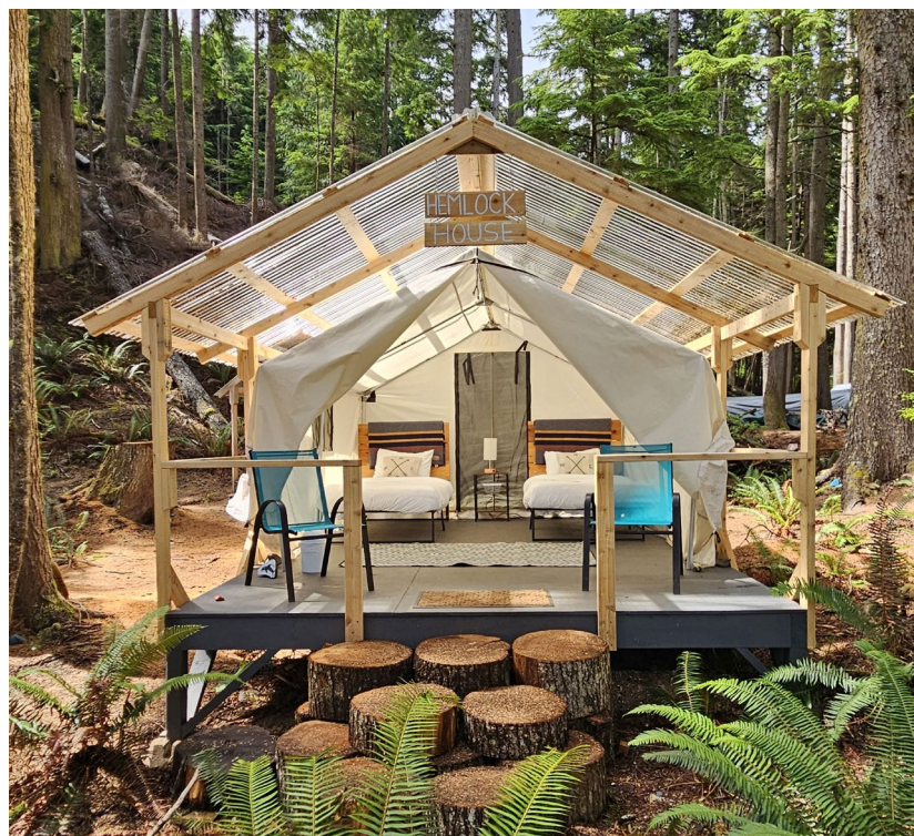
Glamping Tent at Orca Camp

Providing Quality Packaged Travel Since 1972