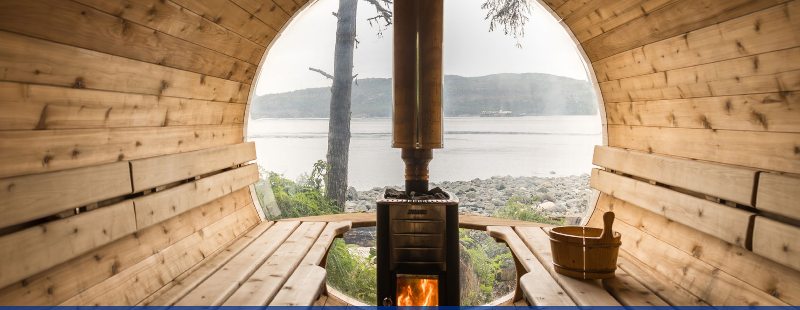
Sauna at Orca Camp