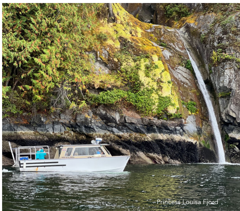
Princess Louisa Fjord

Providing Quality Packaged Travel Since 1972