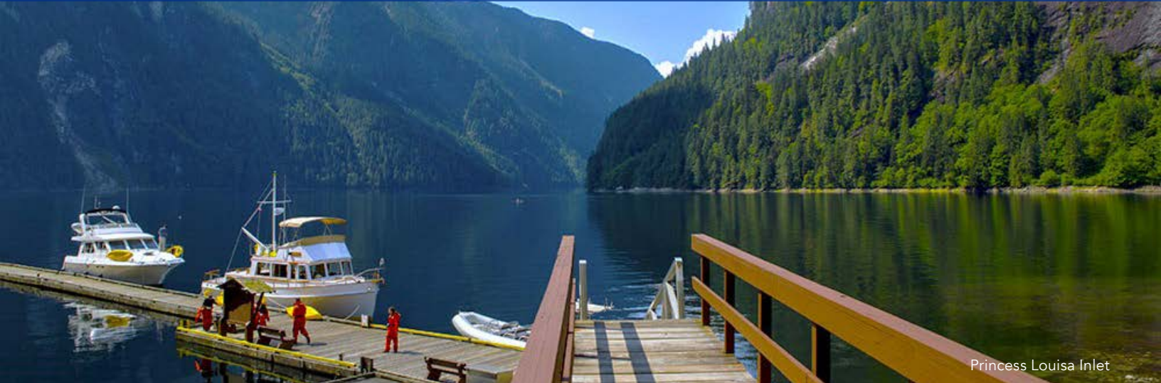
Princess Louisa Inlet