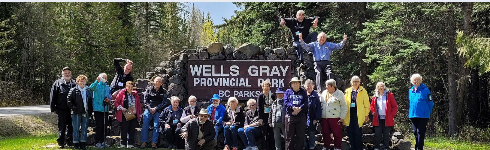
Wells Gray Group at Park Entrance

This tour can accommodate 46 participants.