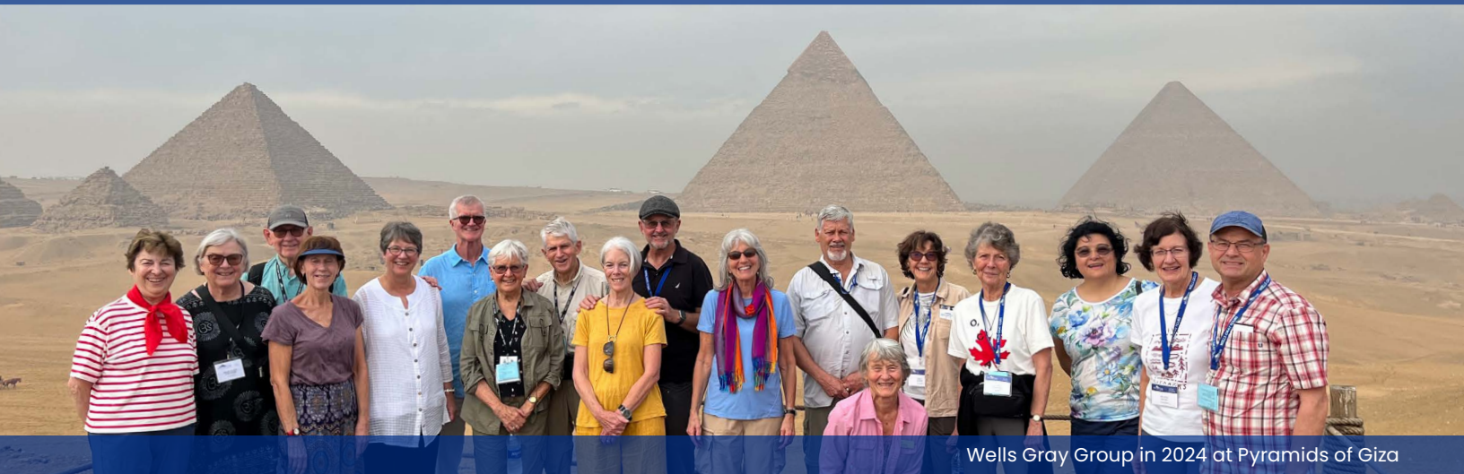
Wells Gray Group in 2024 at Pyramids of Giza