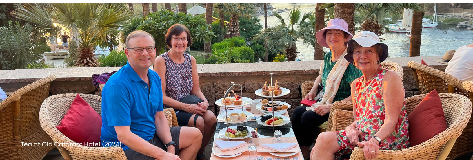
Tea at Old Cataract Hotel (2024)