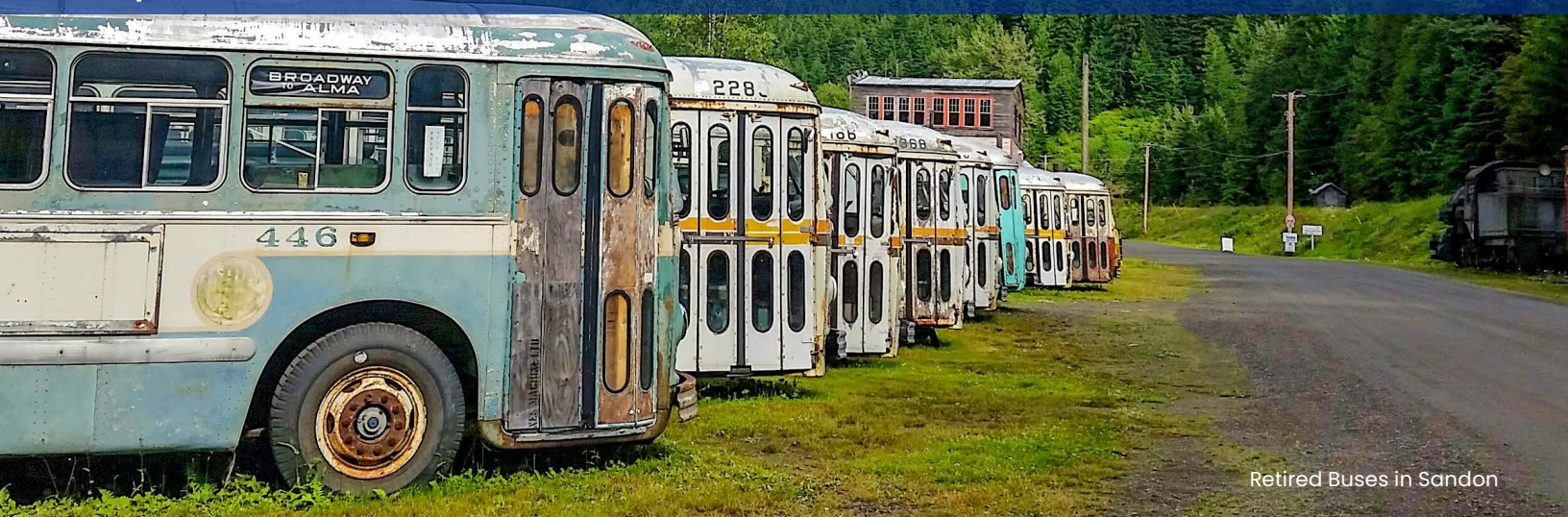
Retired Buses in Sandon