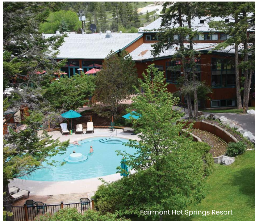
Fairmont Hot Springs Resort

Providing Quality Packaged Travel Since 1972