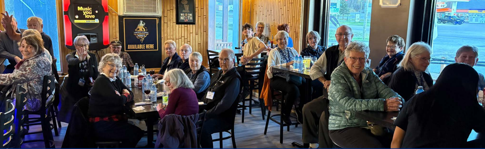
Guests enjoying dinner on the 2025 Fall Mystery Tour