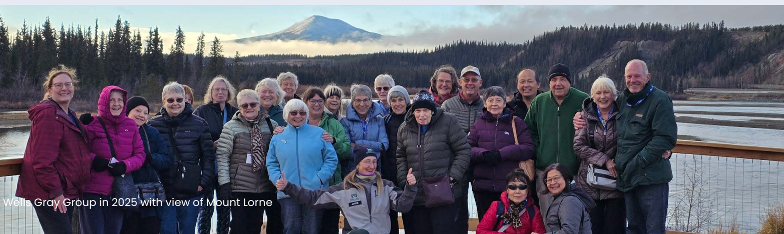
Wells Gray Group in 2025 with view of Mount Lorne

This tour is limited to 25 participants, making it a more intimate travel experience.