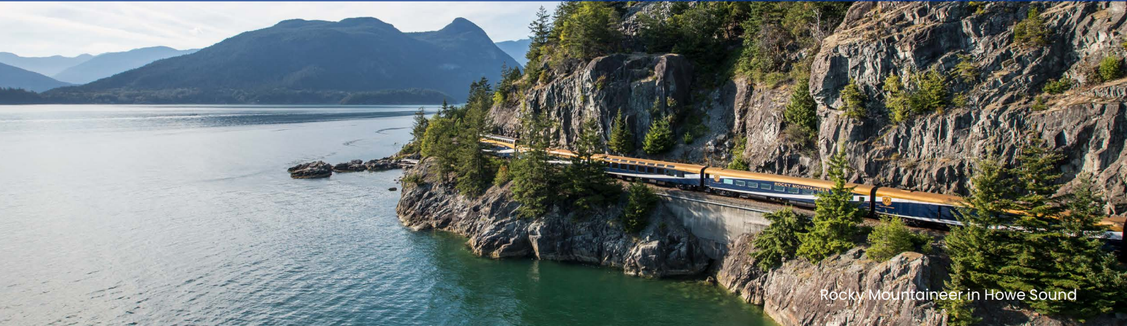
Rocky Mountaineer in Howe Sound