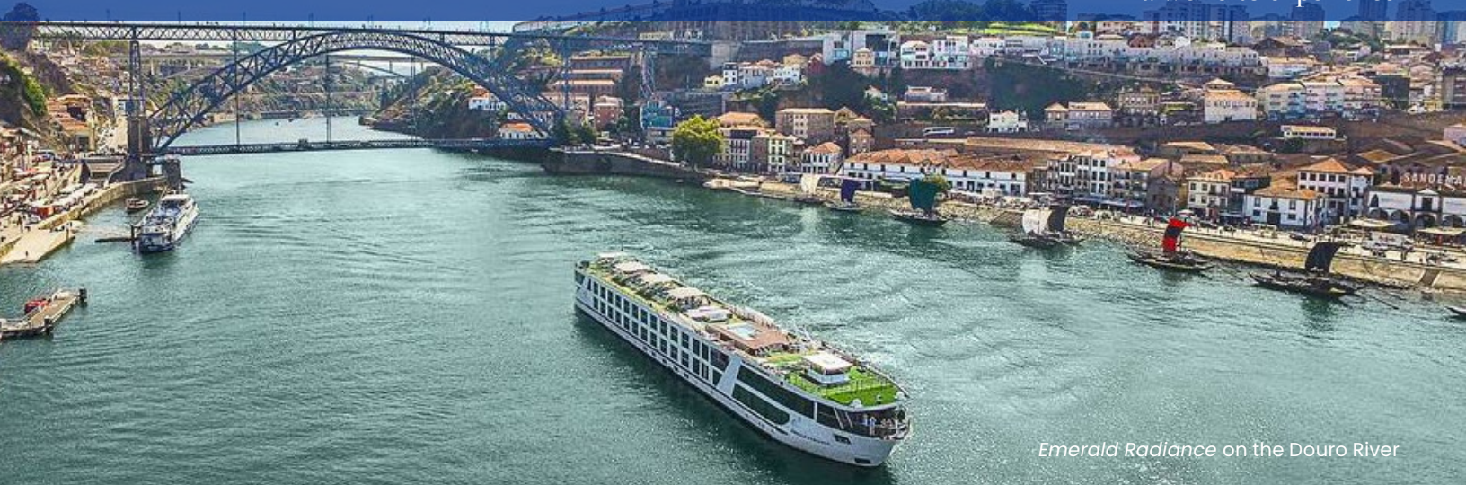
Emerald Radiance on the Douro River