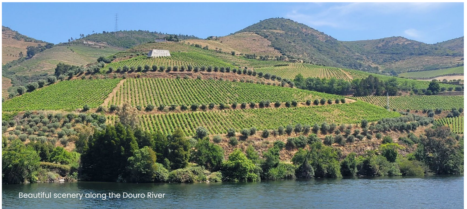
Beautiful scenery along the Douro River